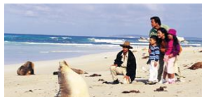
Fleurieu Food, Wine & Wildlife Tour RM _____/pax