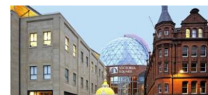
Adelaide City Highlights RM _____/pax