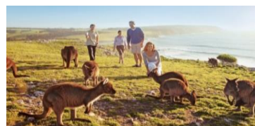
1 Day Kangaroo Island Experience RM _____/pax