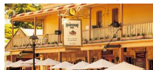
Adelaide Hills & Hahndorf RM _____/pax