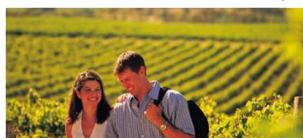
Barossa Food & Wine Experience RM _____/pax