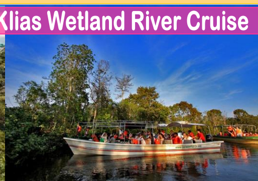
Klias Wetland River Cruise