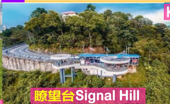
瞭望台 Signal Hill