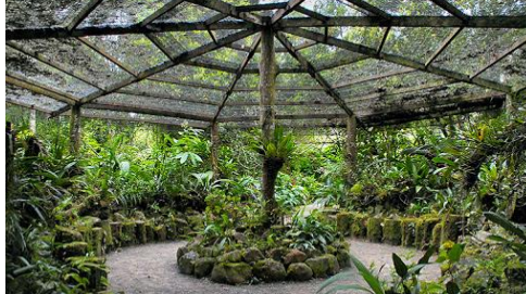
神山国立公园 Kinabalu Park

第二天: 神山国立公园 ~ 昆达山牧场 (早午晚餐) 在酒店享用早餐。出发前往神山国立公园和昆达山牧场之旅。神山是大马最高的山也是大马第一个世界自然遗产, 旅途中导游会带您去纳巴鲁原住民村品尝当地的水果, 买工艺纪念品和拍照留念。海拔一千五百米高的神山公园和牧场除了享受大自然的景色和秋高气爽以外, 我们还安排您们享用牧牛场的第一手新鲜出炉的鲜奶。返回亚庇。