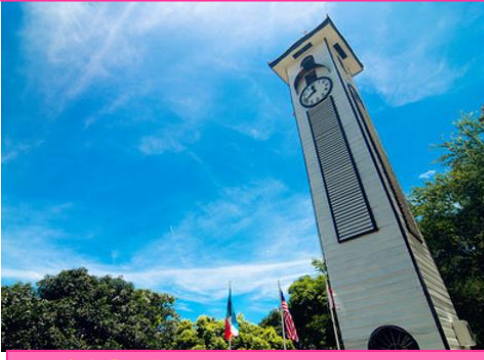
亚庇钟楼 Atkinson Clock Tower

Day 1: Penang - Kota Kinabalu Assemble at Penang International Airport for your flight to Kota Kinabalu, Upon arrival transfer to Hotel for check in. Free at own leisure. Overnight at Kota Kinabalu hotel.